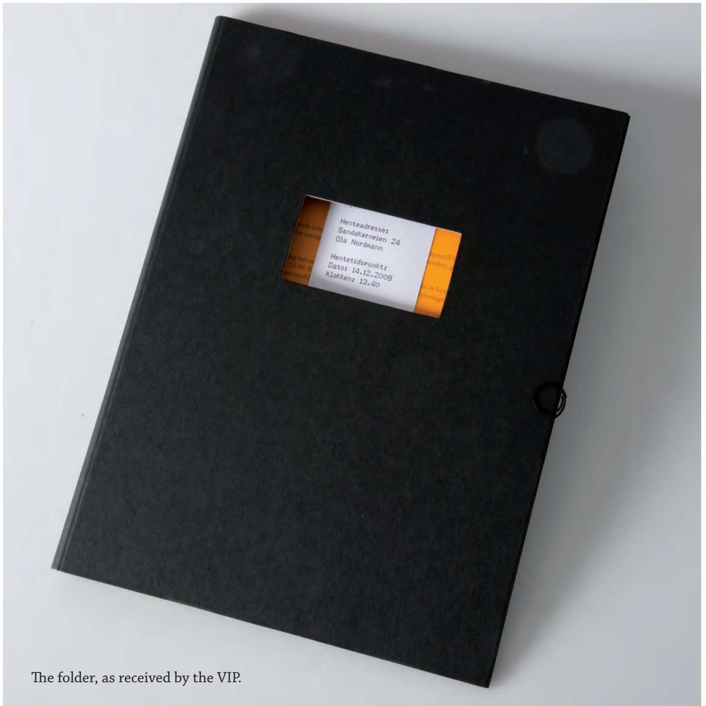
The folder, as received by the VIP.